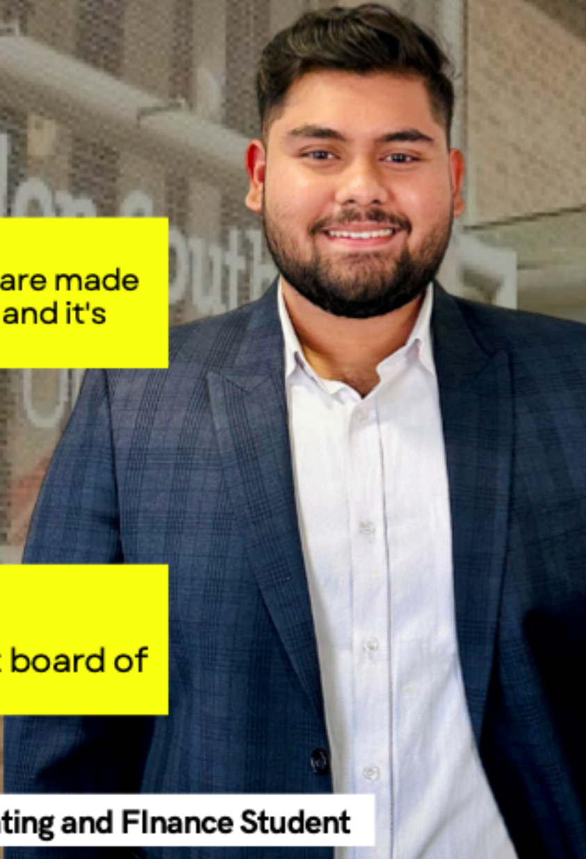
Second Year Accounting and Finance Student

Openness Establish a transparent board of trustees